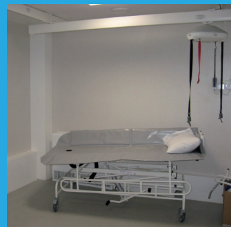
The new Adult Changing Room