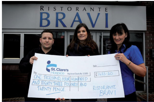
A charity night held at Bravi Ristorante in South Shields raised £1,483.20!