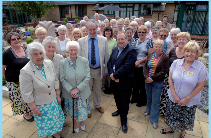
St. Clare's Volunteers celebrate Volunteers Week