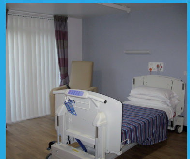
Bedroom 5 – complete with double doors and hoist system.