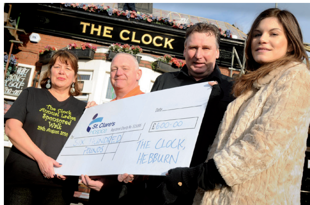
St. Clare's received £600 from The Clock in Hebburn following their recent fundraising efforts