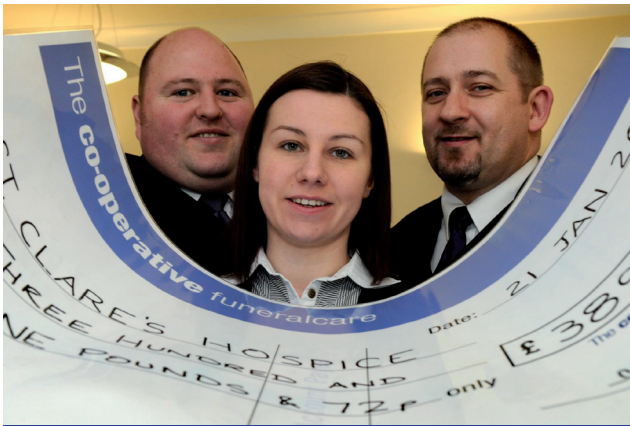
The Co-operative Funeral Care in South Shields raised £389.72 from their annual remembrance service

Below are just some of our supporters who have been fundraising in the local community.