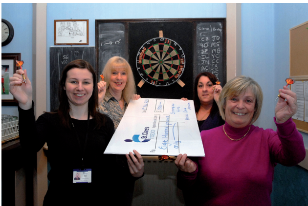
The Simonside Arms, South Shields raised a fantastic £800 from their annual darts marathon.