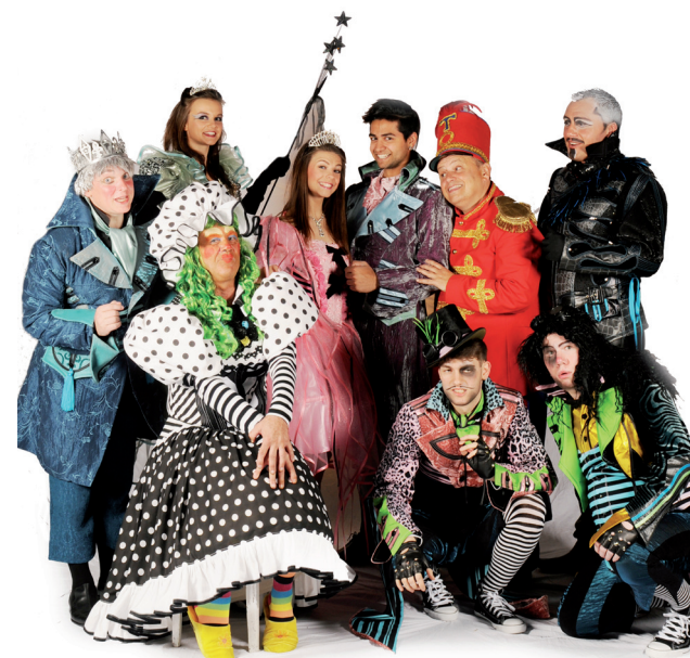
The cast of Puss in Boots

Our patients are delighted with the new vehicle. The personal heaters for each passenger are greatly appreciated by the patients as they can regulate their own temperature.